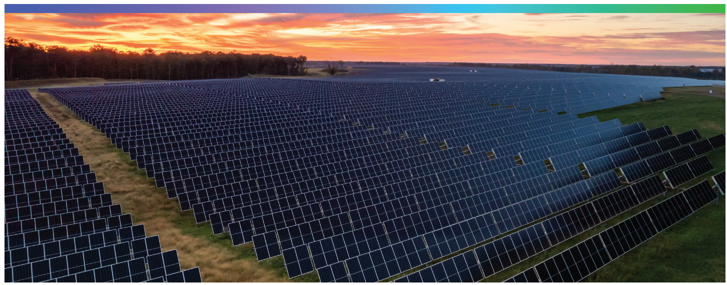
Spotsylvania Solar Energy Center, Virginia